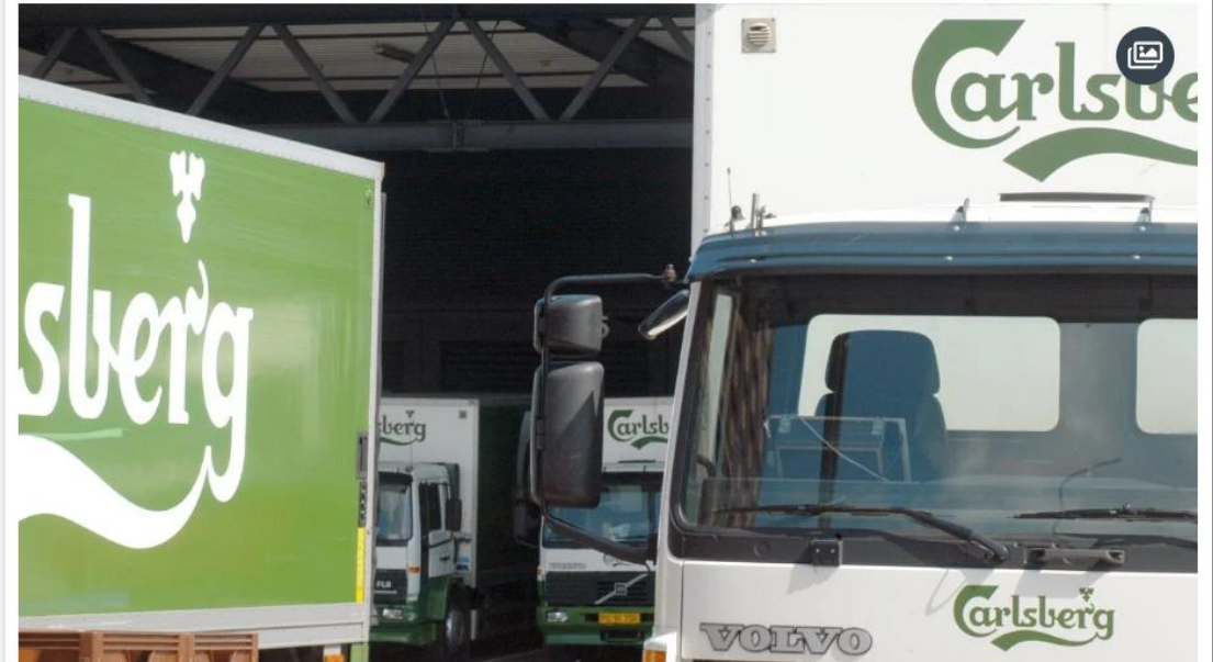
Carlsberg har indgået samarbejde med DLG og Viking Malt om bæredygtig ølproduktion. Arkivfoto

Carlsberg har indgået samarbejde med DLG og Viking Malt og tager et skridt imod en mere bæredygtig ølproduktion med maltbyg dyrket efter regenerative principper.